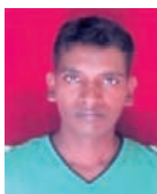
2911 Manohar IT GET