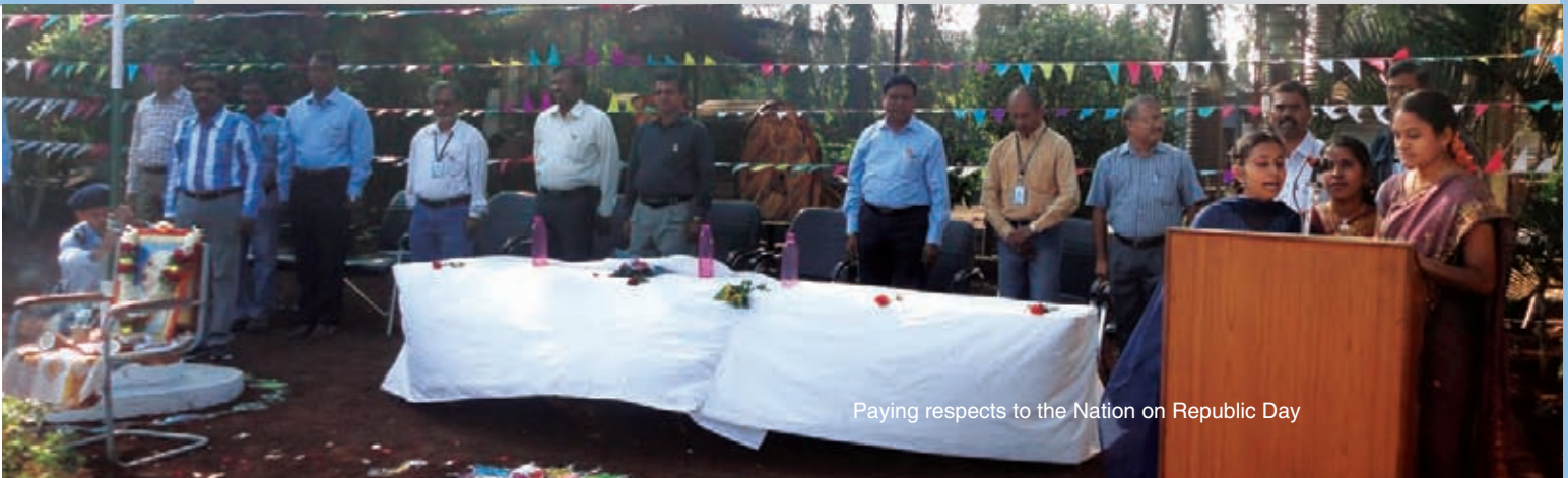
Paying respects to the Nation on Republic Day