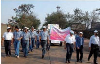
Employees on Safety march .... a pride moment