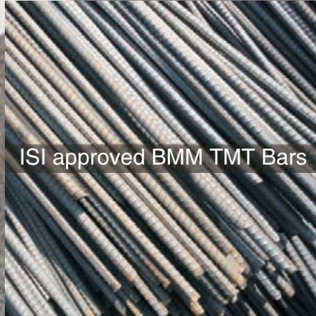
ISI approved BMM TMT Bars