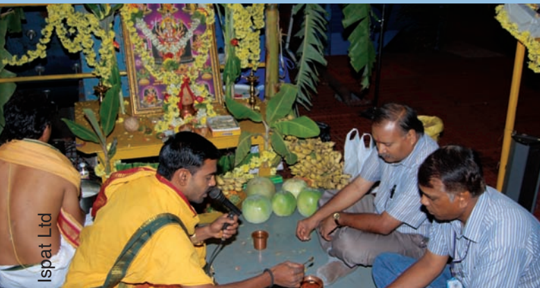
Traditional Puja being performed