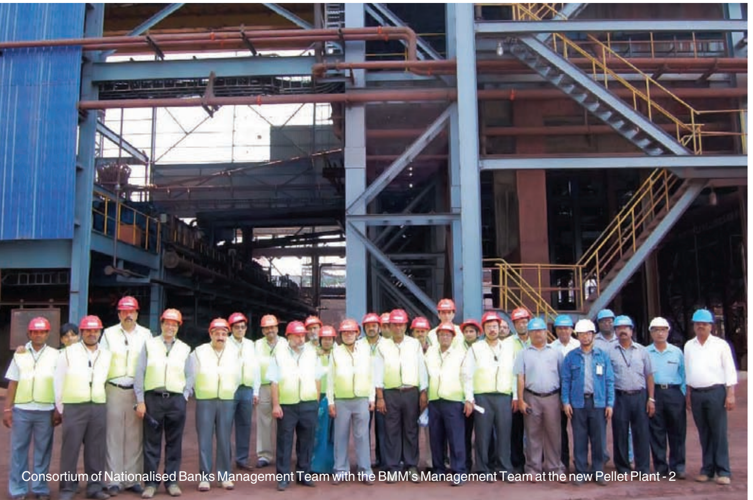
Consortium of Nationalised Banks Management Team with the BMM's Management Team at the new Pellet Plant - 2

Consortium of Nationalised Banks Management Team visited BMM Plant on 21st March 2012 to know the progress made by the company and the entire team left with satisfaction that their financial assistance is in safe hands