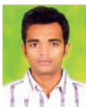
2923 Achunala Rajesh Beneficiation Plant - II GET