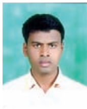
2899 Tejraj Beneficiation Plant - II GET