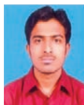
2915 Doddabasappa G Beneficiation Plant - II GET