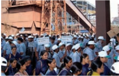
Cheerful BMMites actively taking part in the safety march