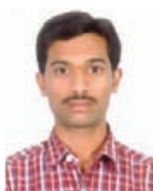
2913 Nagaraja S A Pellet Plant - II GET