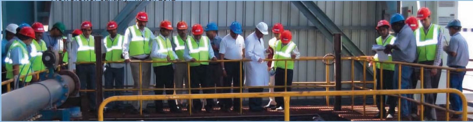
Officials of the Consortium of Nationalised Banks taken through the BMM's new facilities