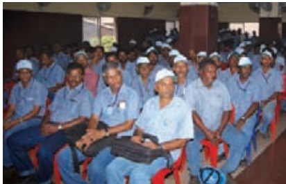
A section of audience Participated in the safety day program